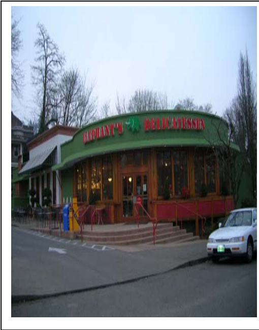
Portland, Oregon Bank: US Bank Financing Structure: 59 / 31 / 10