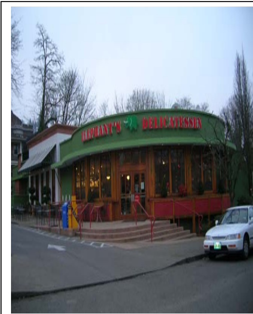
Portland, Oregon Bank: US Bank Financing Structure: 59 / 31 / 10