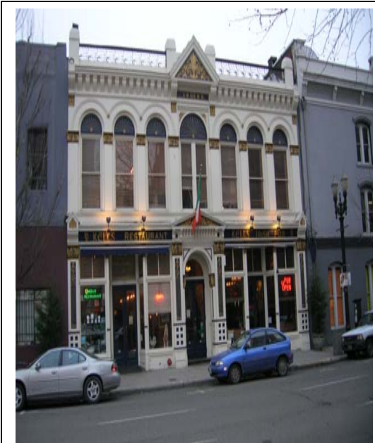
Portland, Oregon Bank: Wells Fargo Bank Financing Structure: 50 / 35 / 15