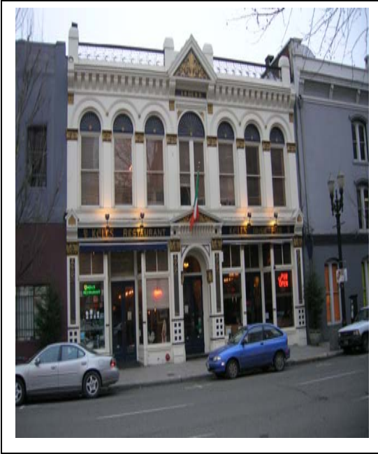
Portland, Oregon Bank: Wells Fargo Bank Financing Structure: 50 / 35 / 15